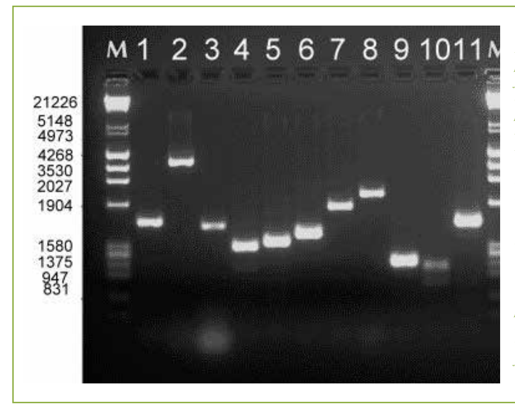
Figure (3). RT – PCR amplification of mRNA isolated from patients with thyroid disorders using hexamere primers. M is a marker of Lambda DNA digested with EcorI and HindIII, lane 1, 3, and 11 is the result of healthy persons, lane 2 the result of patient of medullary carcinoma, lane 4, 5, 6 is the result of patients with hyperthyroidism, lane 7 and 8 is the result of patients with hypothyroidism, lane 9 and 10 is the result of patients with papillary carcinoma. Gel electrophoresis was performed at 10 v/cm for 2 hrs in 1 % agarose.

dysfunction was used to search for markers that can be useful to determine the genetic change in their thyroid and the possibility to diagnose patients that may develop thyroid cancer at early stage. This required isolation of mRNA from blood and generating DNA by using it as a template for RT – PCR. This was made by using a kit developed for this purpose, and. Result of using random hexamere primers is shown in figure (3).